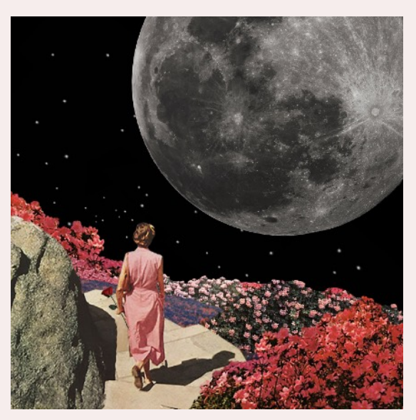
Pre-Save Full Moon <u>HERE</u> out 10/2