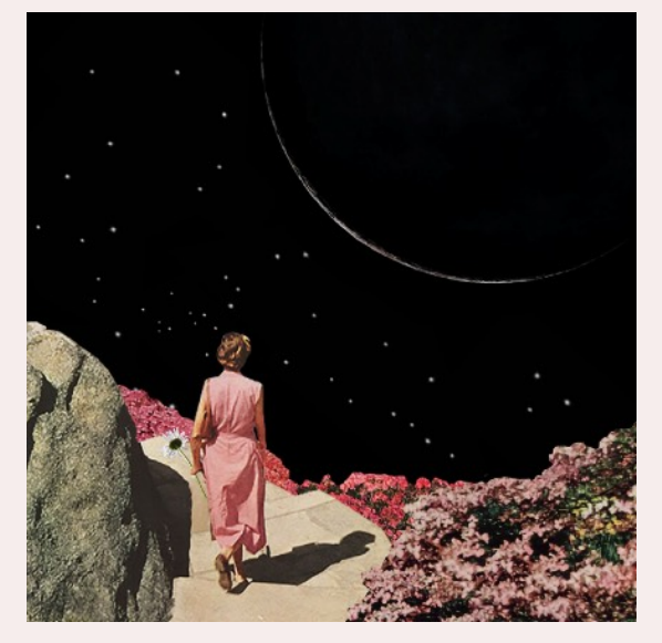
Listen to New Moon HERE