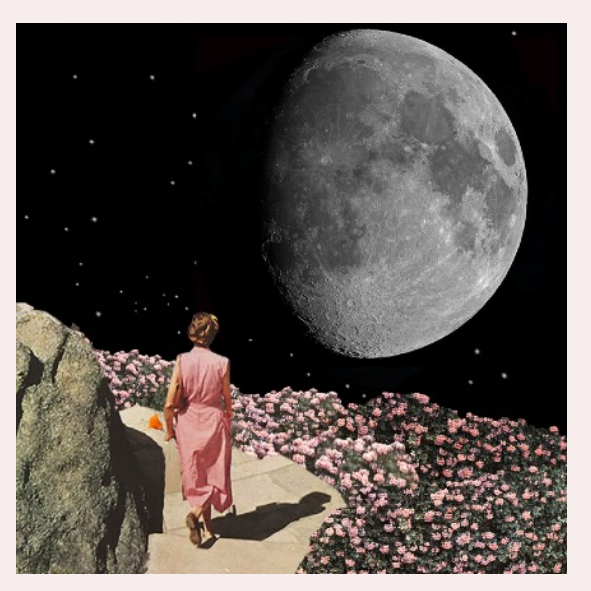
Listen to Waxing Moon HERE