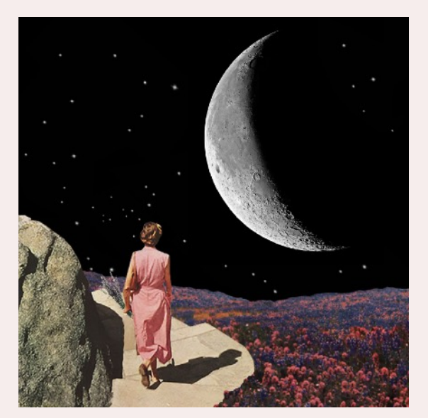
Waning Moon out 10/15

"We tip our hats to Hillary Capps' forthcoming album, The Way Back Home , for its slow unveiling in coordination with our sister Moon. Releasing in four parts in tandem with the four lunar cycles (new, waxing, full, and waning)... the tracks themselves slowly illuminate Capps' penchant for lush indie pop and introspective lyricism" - The Deli Magazine